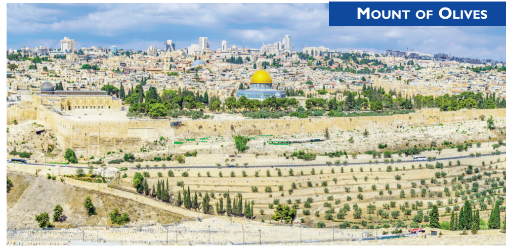
MOUNT OF OLIVES